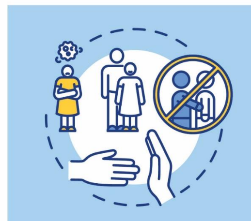
Quarantine facility to monitor and manage suspected cases