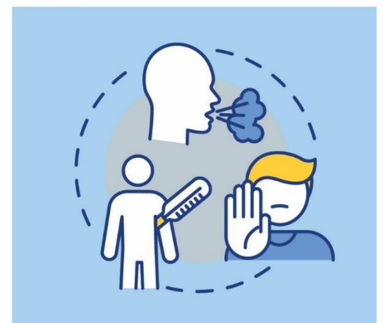
Health screening of all Visitors, Contractors', and Crew on a weekly basis while they are present in the shipyard