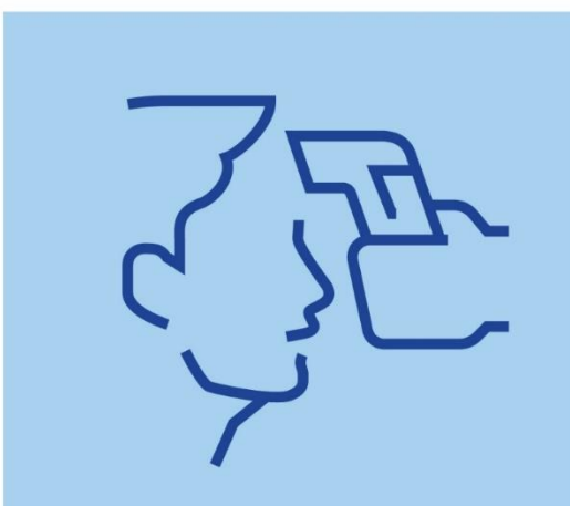
Random Temperature checks on vessels throughout day and night shifts