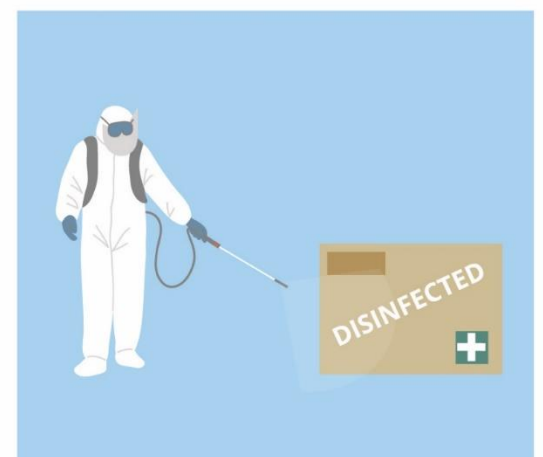
Regular disinfection of the yard