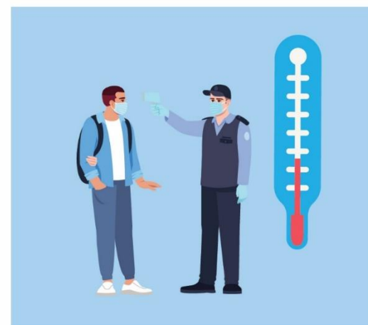
Temperature checks at the gate and office areas on arrival