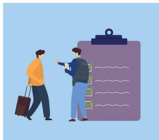
Pre-arrival Medical Declaration for all personnel